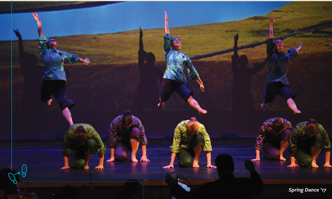
Spring Dance '17