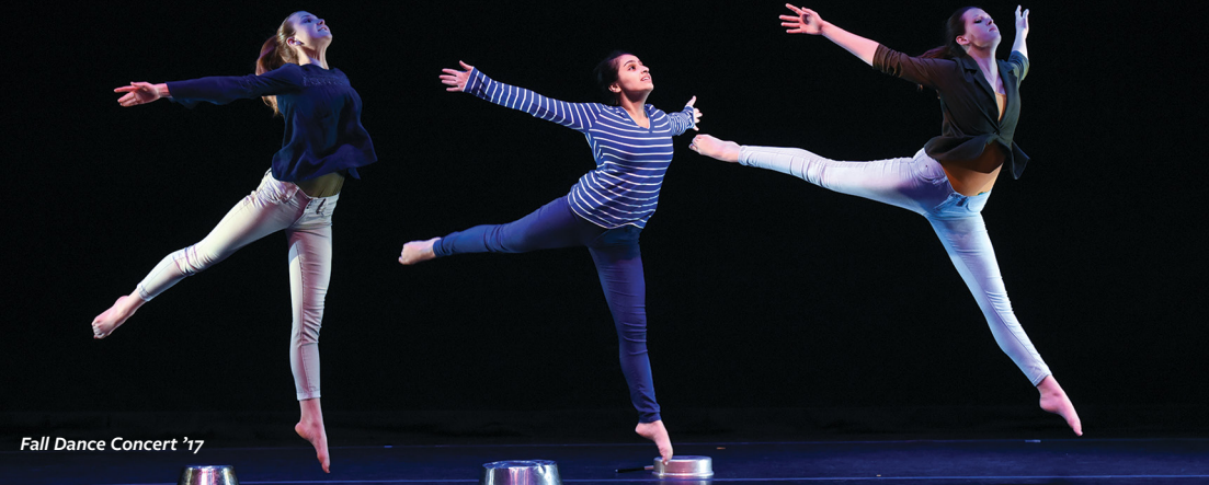
Fall Dance Concert '17