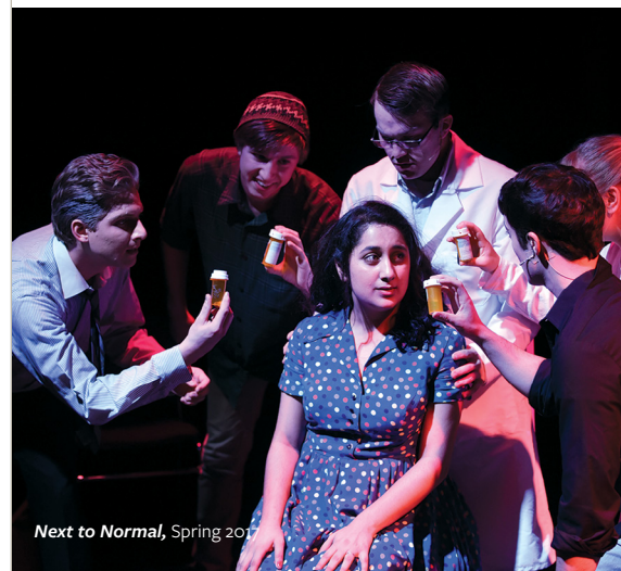
Next to Normal, Spring 2017