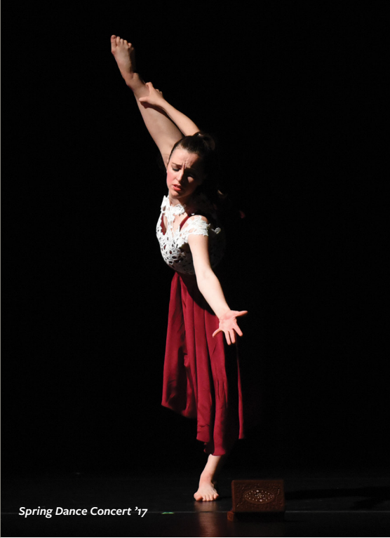
Spring Dance Concert '17