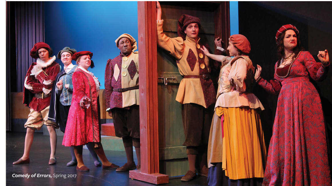
Comedy of Errors, Spring 2017