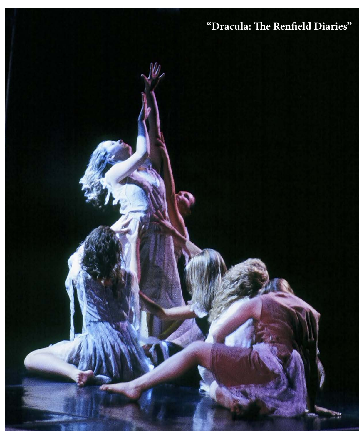
"Dracula: The Renfield Diaries"