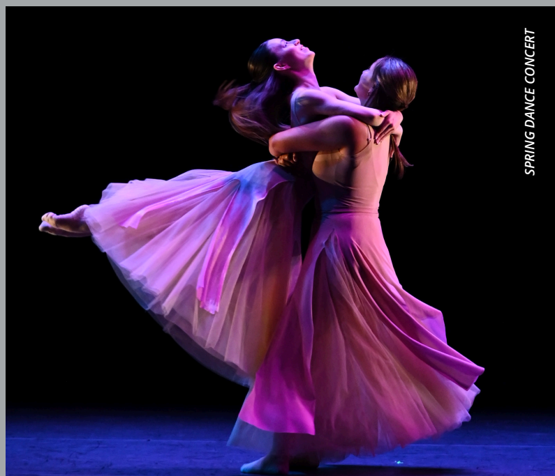
SPRING DANCE CONCERT

If your student group is interested in performing in this showcase, please reach out to the dance program director dm048@bucknell.edu .